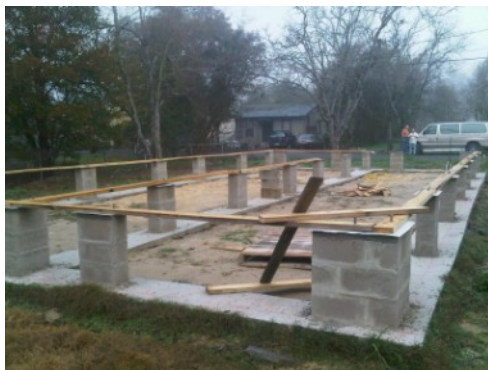
The relief team was able to raise the 3rd house that Fairmount built during Big Build 2009.

January 7, 2012 marked the date for another trip to the great state of Texas. This trip was an extension of several past disaster relief projects that Fairmount has initiated to help areas still suffering the devastation of Hurricanes Ike & Rita. Orange, Texas has been our point of service for a dozen trips. Like the others, this trip was another opportunity to serve the Lord. We got to raise up the 3rd house that Fairmount built during