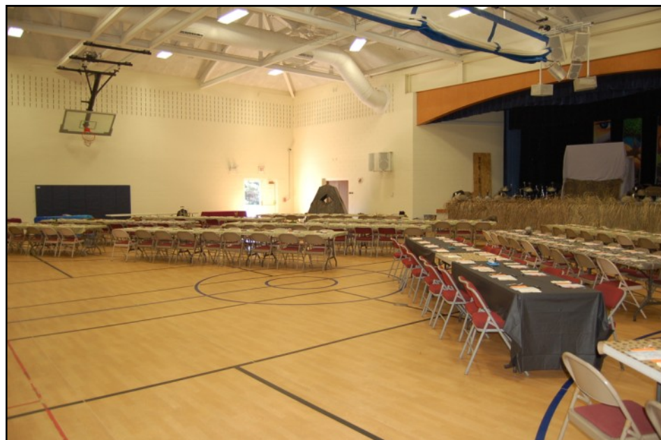
▲ The gym was set up to provide a hunting, outdoors atmosphere. A duck blind was built on the stage and several animals were displayed.